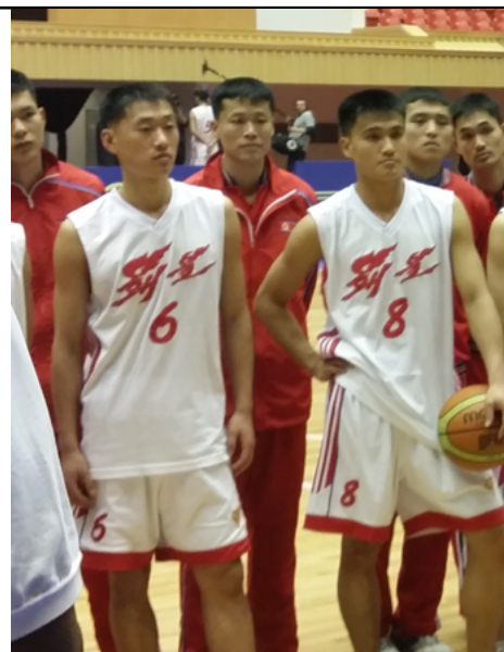
NK | National Team Members

V: I would. I got so much stronger. Spiritually, I came back stronger. I am in the life of ministry, and I feel like there were lives, even on that trip, that were effected. That