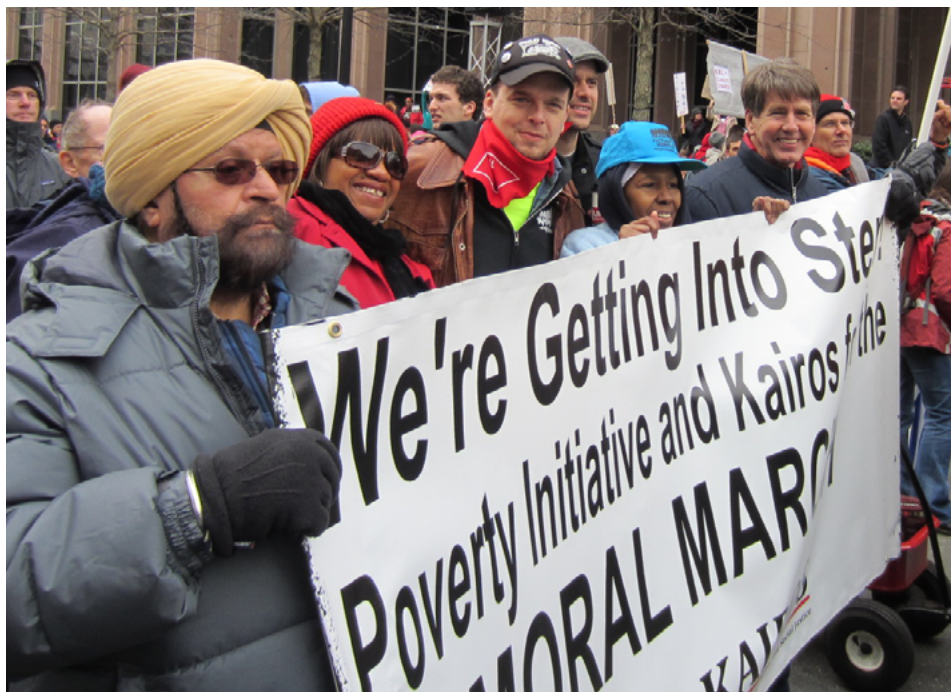
POSITIVE ACTION IN N.C. | Union Friends Take to the Streets

I have yet to experience anything which can compare to singing “We Shall Overcome,” arms linked with strangers, amongst a crowd of tens of thousands. I feel privileged to have been able to add my small voice to those lifted in song and privileged that I did so as a representative of Union Theological Seminary. This was the kind of experience that I have only read about in history books; this is what democracy looks like.