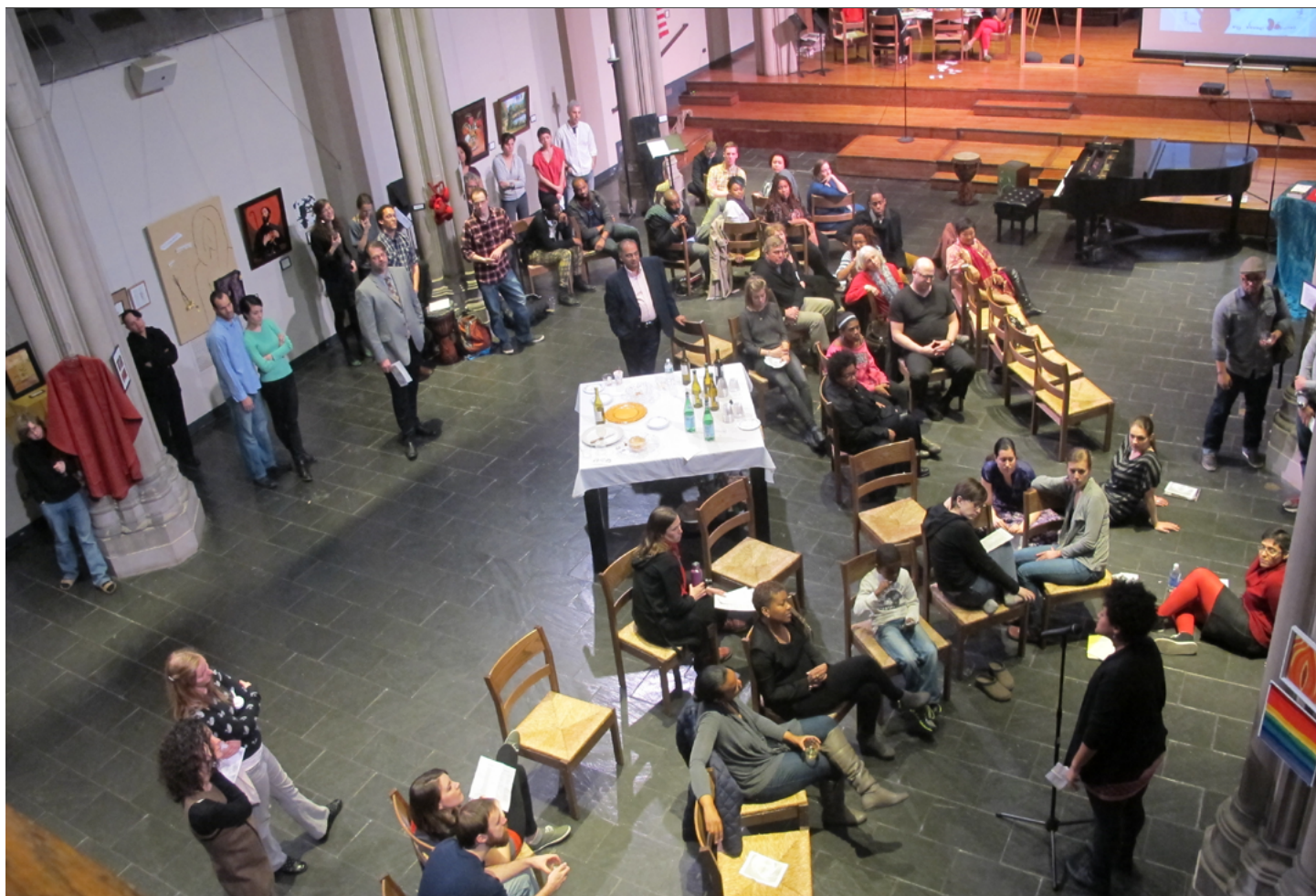
ART AND THEOLOGY IN JAMES CHAPEL | Photo from the Community Art Show '13

Email artscaucus@gmail.com for any questions and for the submission forms.